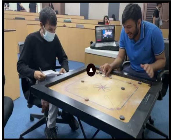
Students participating in the events