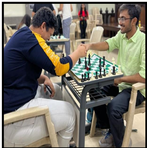
Students participating in the events