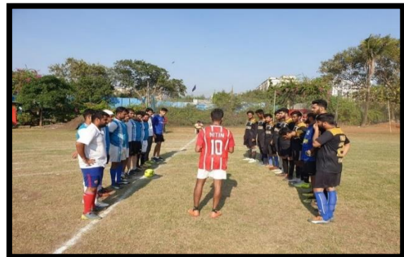
Students participated in the event