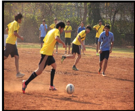
Students participated in the events