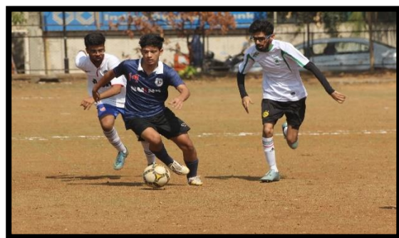
Students participated in the event