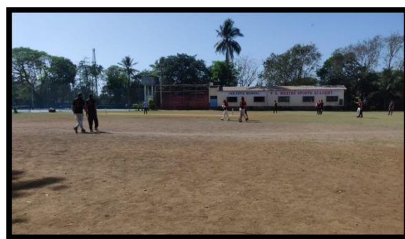
Students participated in the event